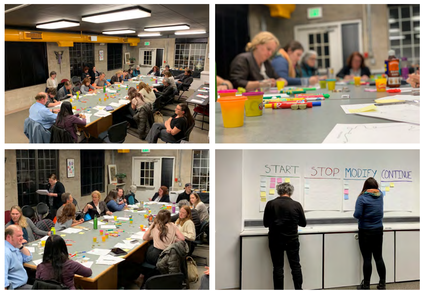
Measure the Health of the Arts in Salt Lake City

"I think the arts are alive in the broad picture of the city. But ... I think the arts in city government are struggling due to poor leadership, lack of vision and misplaced priorities in terms of where they are housed. I also think there is too much to focus on the arts only being downtown or at the university and not enough focus on neighborhoods with higher needs, particularly the west side."